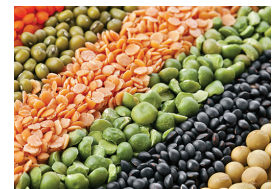
Pulses & Soybeans